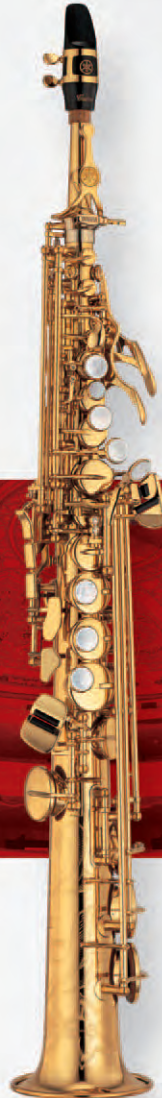
YSS-875EX with Straight neck SG2

Finish: Silver-plated Auxiliary Keys: Front F, High F♯ key Neck: Custom TE1S Case: TSC-875EX